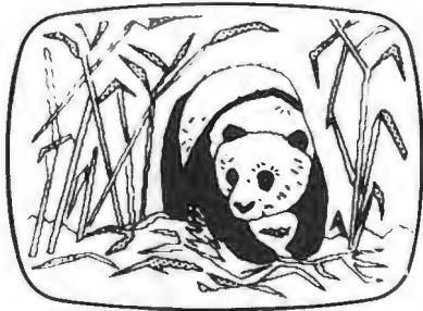
FREE-HAND DRAWING ICON SOFTWARE