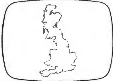
USING GRAFPAD FOR TRACING